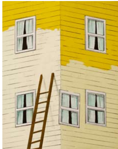
Corner, 2007 Color softground and aquatint etching, Paper size: 27.5" x 22.5"; Edition of 20

A: There are all these contradictions in it, right? From the time I first started making art, I was interested in things being on the edge of visual clarity, in things that would leave open a question of how you would understand them visually. For example, water is the kind of elusive