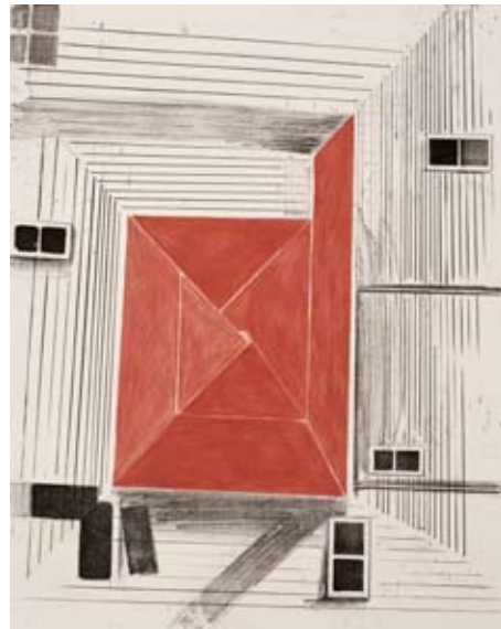
Red Square, 2007 Color softground etching, Paper size: 27.5" x 22.5"; Edition of 20

Q: Let's talk about the imagery. Certain images seem part of a collective awareness, and others seem completely personal. Where do they come from?