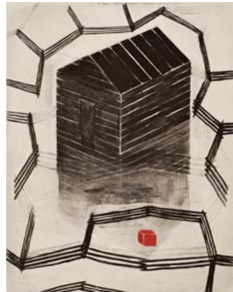
Fenced In, 2007 Color softground etching, Paper size: 27.5" x 22.5"; Edition of 20

A: In the beginning of any exploration, I tend to paint more realistically as a way of trying to figure out the image for myself